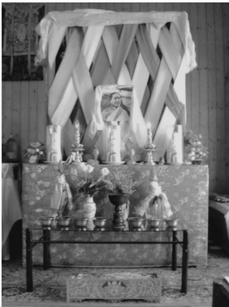
HH's practice seat and where he entered parinirvana in his room (Dordogne).