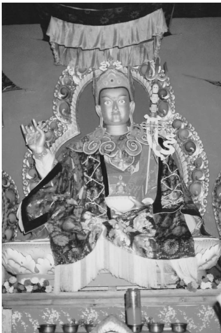
From Dudjom Rinpoché's public shrine room in Dordogne, France