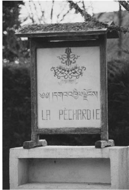
below: HH's home with prayer flags (Dordogne).