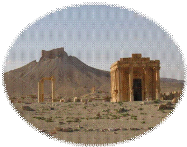
Xvlun - Temple of Baal Shamin Palmyra Syria {{cc-by-sa-2.5}}