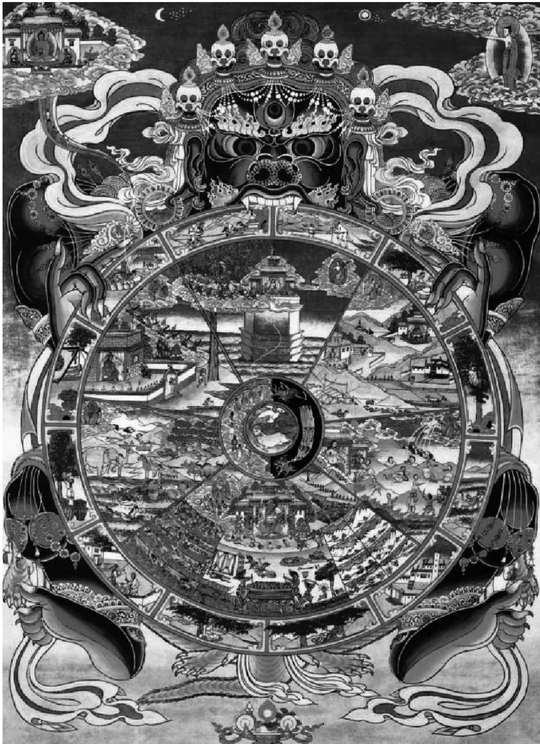
The Wheel of Life (Bhavacakra). The nidanas are situated in the outer rim of the wheel.