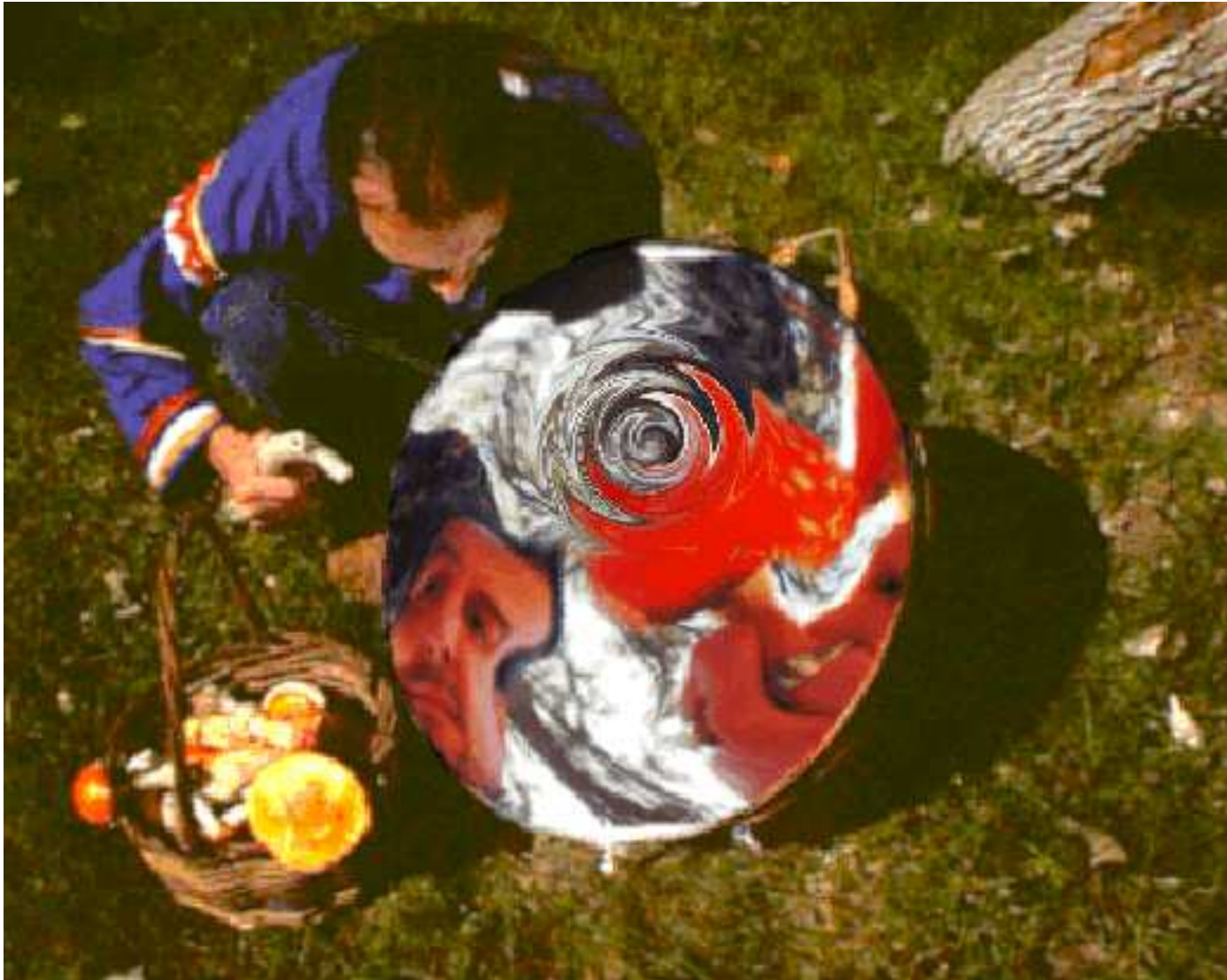
Figure 8.1. The seiðman with Fliegenpilze