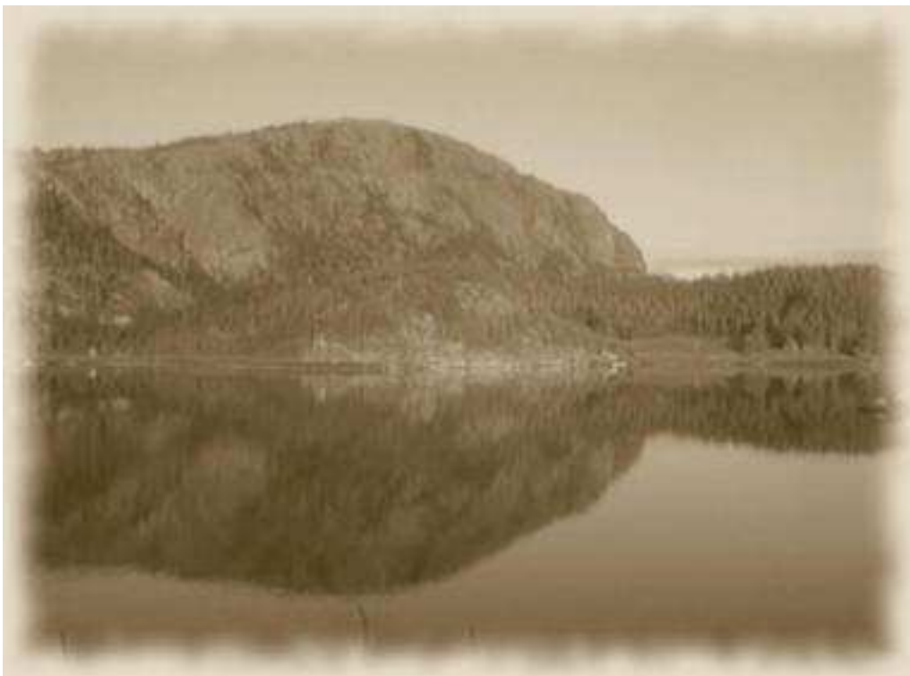
Figure 5.1. A photo of Helheim—Fosnes—Reflection in the water