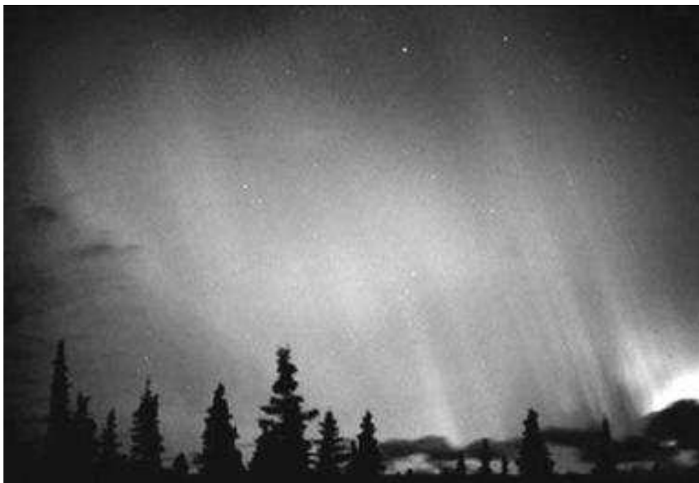
Figure 4.3. Aurora Borealis—Souls flying

time,” a crack between this world and the Otherworld. Such “cracks” are common in Germanic folk medicine and folk magic, such as making magic on the sand at a point in between the levels of the tide or in a cave. 24 This concept continues to figure in modern native herbalism of northern Europe and will be discussed at length in later chapters.