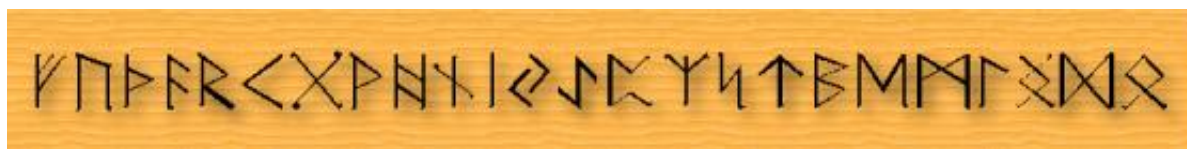
Figure 7.1. The carved FUPARK

and throw them completely at random onto a white cloth. Then the priest of the state, if the consultation is a public one, or the father of the family if it is private, offers a prayer to the Gods, and looking up at the sky picks up three strips, one at a time, and reads their meaning from the signs scored on them. If the lots forbid an enterprise, there is no deliberation that day on the matter in question; if they allow it, confirmation by taking of auspices is required. Although the familiar method of seeking information from the flight of birds is known to the Germans, they also have a special method of their own—to try to obtain omens and warnings from horses.” 9