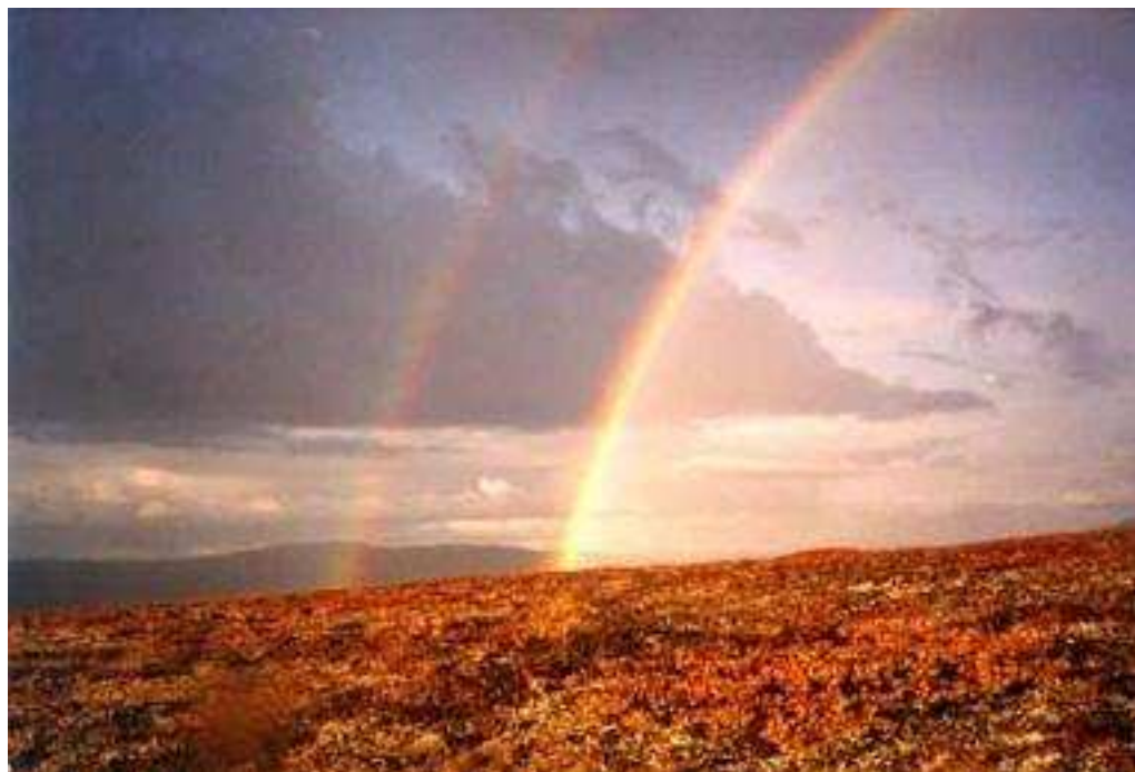
Figure 4.2. Himinbjörg—to the far North

were, and in many places still are, Halloween and Yule, and the period of time in between the two holidays was considered to be an especially dangerous time for being outdoors at night. Because of the reciprocity between the middle- and underworlds (see Chapt. 4), the best time for travel for the inhabitants of the underworld would have been at night in the winter (in middleworld terms) because in the Land Below it would be early summer during the day. The primary Day of the Dead for the Scandinavians was Yule—essentially Midsummer for the inhabitants of the Land of the Dead, and for the Celts it was Halloween or Samhain.