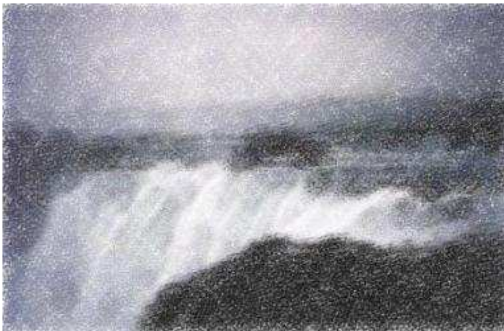
Figure 3.1. Goðafoss–Falls of the Gods

It makes good sense that the early settlers of Iceland would try to make peace with these beings because they knew that it was the only way to tap into the land's power/ luck without which life in the new country was sure to be unsuccessful.