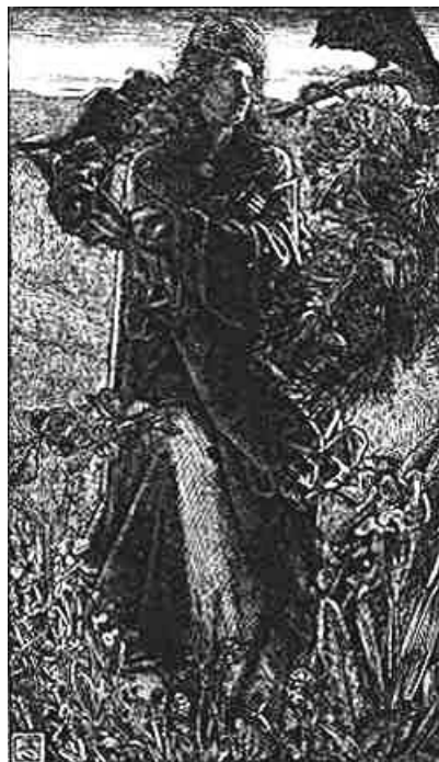
Figure 7.2. Northern Seeress

The type of knowledge that these people dealt with often went far beyond that of the charm-makers and runemasters. Rather than simply “reading the Waters of Urð” to gain knowledge of orlög so that actions could be adjusted accordingly, these men and women had “drunk directly from the Well of Mímir” and had acquired the knowledge and skills to manipulate events directly. They were no longer the marionettes on the stage like average people, as described in Chapter 2, but are the