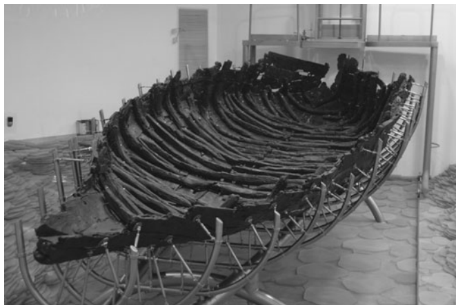
From the Galilee Boat to the Megiddo Prison Mosaic