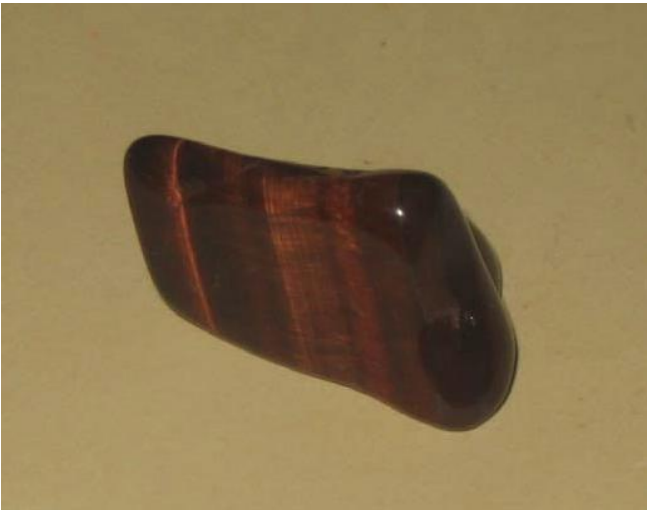
Red Tiger Eye