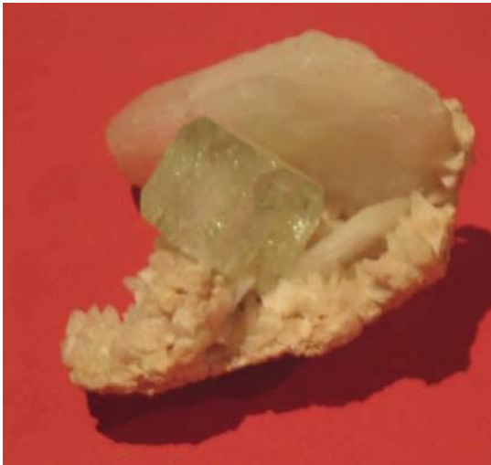
Green Apophyllite & Stilbite