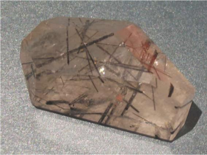
Tourmalinated Quartz Crystal