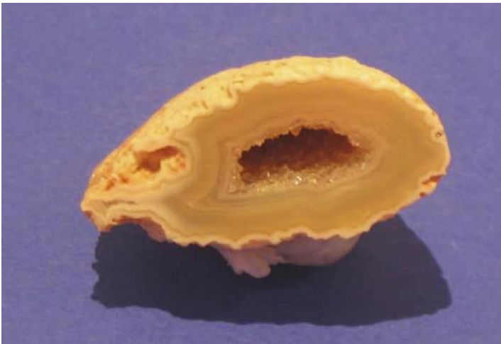
Crystal Quartz Geode