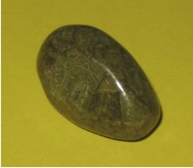
Chinese Green Jade