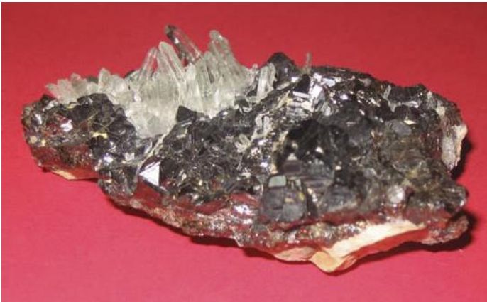
Galena with Quartz Wands