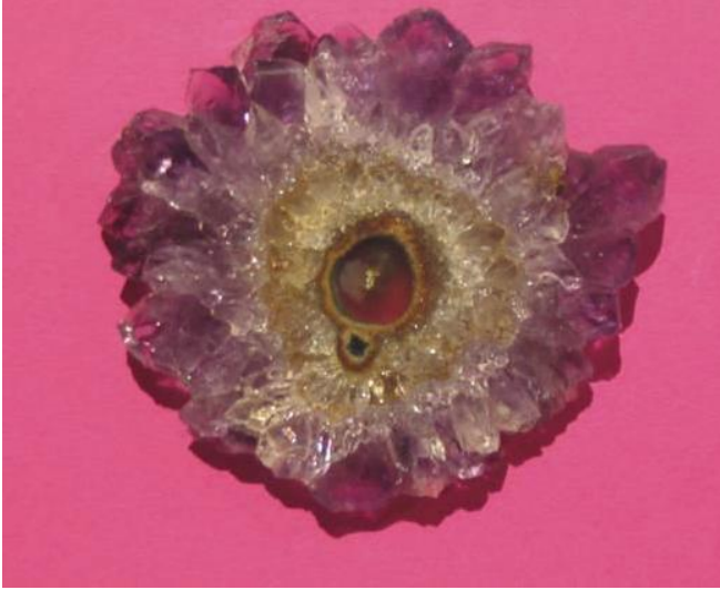
Amethyst Stalactite Slice