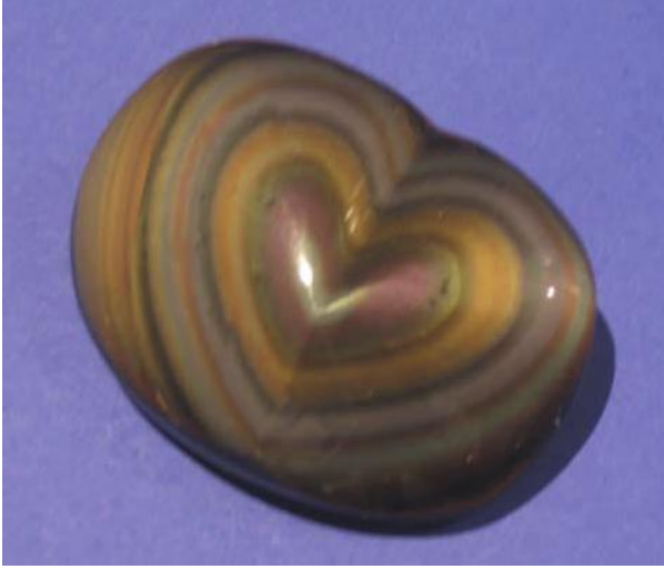
Rainbow Obsidian Heart