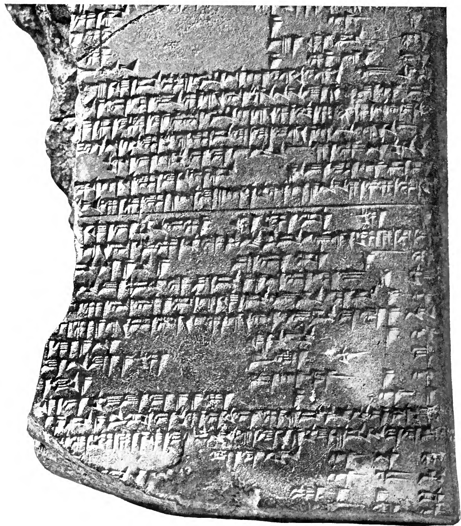
Part of the tablet supposed to contain a mention of the Babylonian Garden of Eden (K. 111).