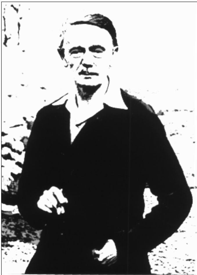
Clark Ashton Smith (1893-1968)