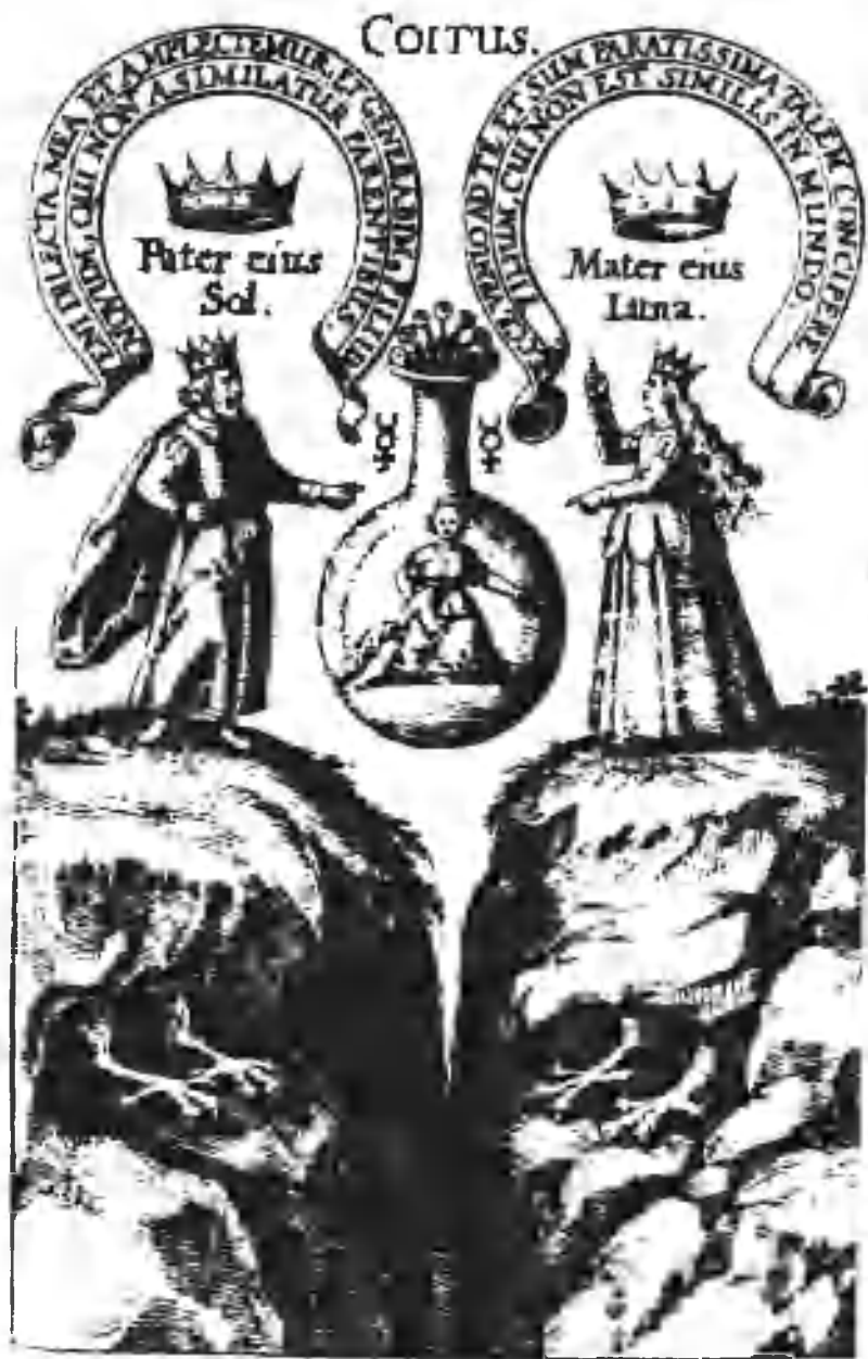
The union of the two principles, Male and Female, Sun and Moon, Sulphur and Mercury, Fire and Water, etc.