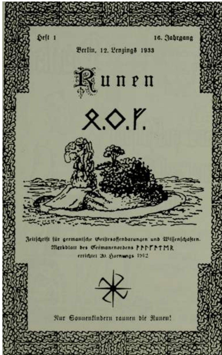
Runes: Journal fin German Spiritual Revelations and Science