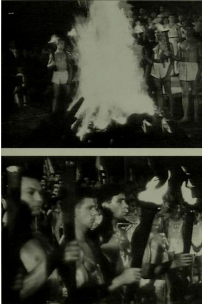
Organisation (foreign division) of the Nazi Party. The film, entitled Winter women was directed by Gerhard Huttula*