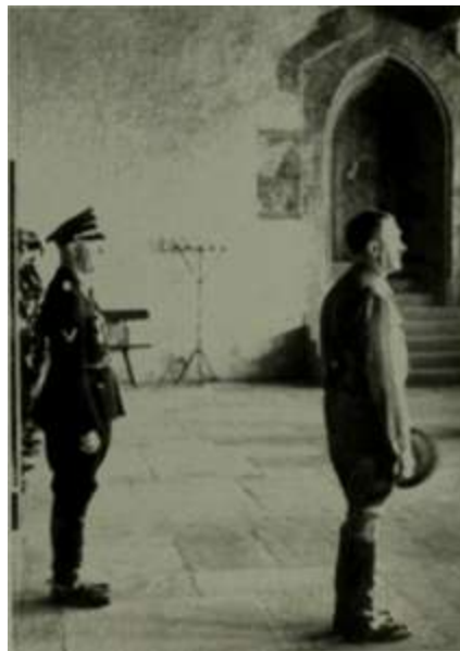
Himmler and Hitler in Wewclsburg